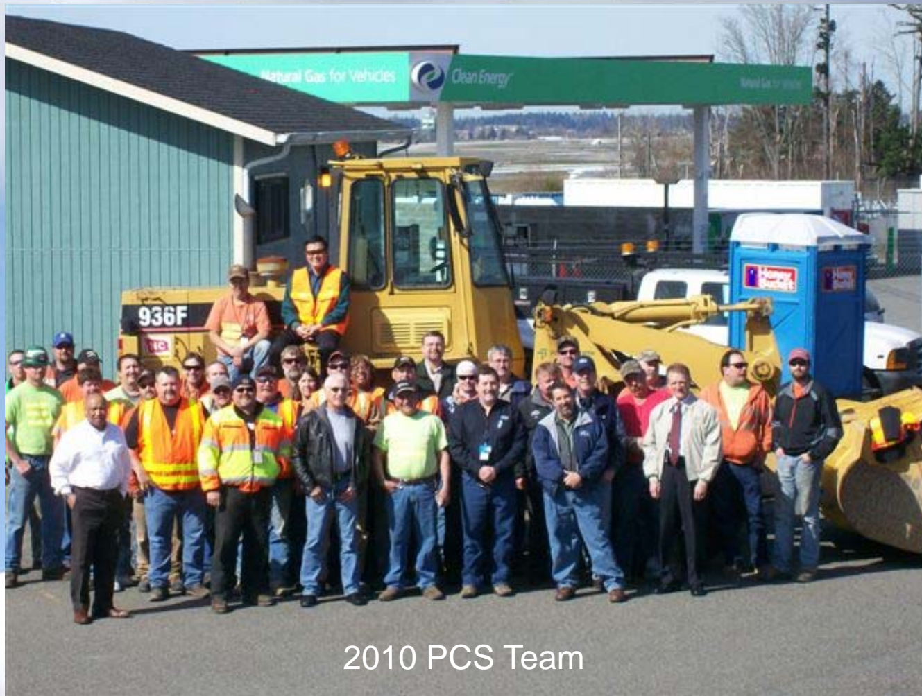
2010 PCS Team