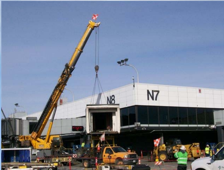
Airport N7 Jet Bridge Installation